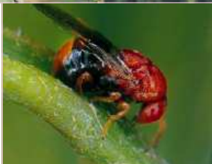
Long-leaved wattle ( Acacia longifolia ) with galls formed by a bud galling wasp ( Trichilogaster acaciaelongifoliae )