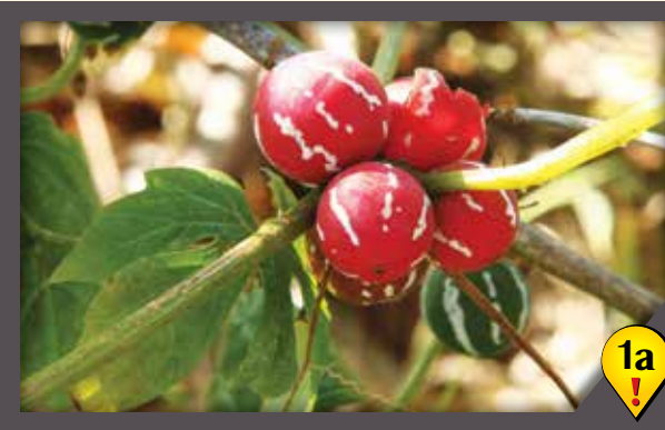
Lollipop climber ( Diplocyclos palmatus )