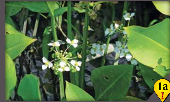
Delta arrowhead ( Sagittaria platyphylla )