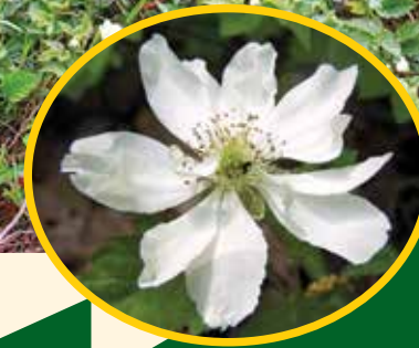
Bramble ( Rubus flagellaris )