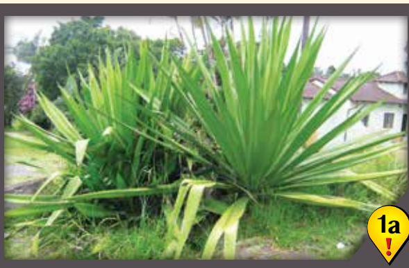
Mauritian hemp ( Furcraea foetida )