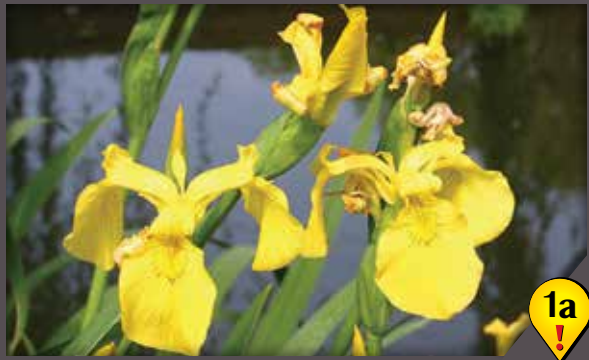
Yellow flag ( Iris pseudacorus )