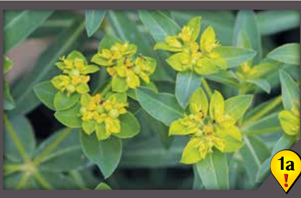
Leafy spurge ( Euphorbia esula )