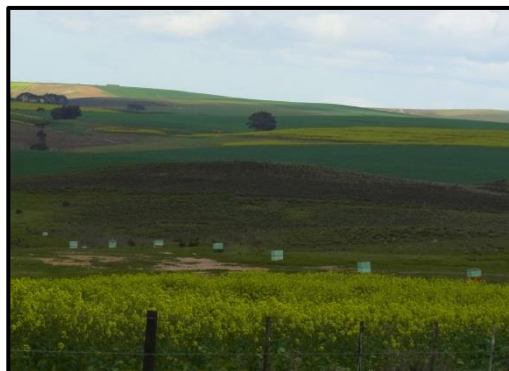
Canola fields are important to beekeepers in the Western Cape

Agro-chemicals have been found by some studies to be one of the leading causes of honeybee deaths across the Northern Hemisphere. Common insecticides such as neonicotinoids and pyrethroids have been shown to negatively affect learning behavior, foraging activities, and nest site orientation by honeybees. The correct management of agro-chemicals therefore plays a large role in the sustainability of crops as a honeybee forage resource. Education and awareness on chemical application and safety is needed amongst farmers, farm workers and extension officers as use contrary to label instructions is likely a problem in South Africa.